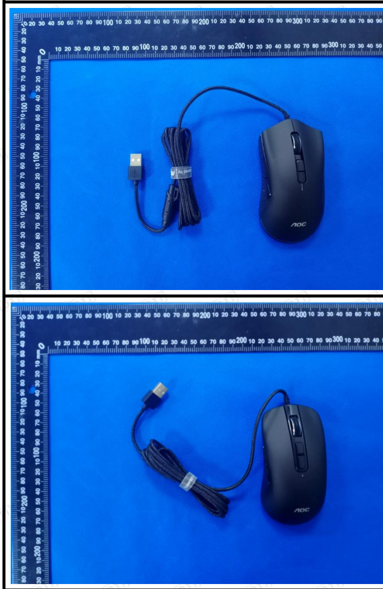
Photograph of Sample